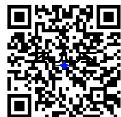
Scan to schedule your personalized demo

Ready to transform your construction approval workflows? Scan the QR code or contact our team for a personalized demo tailored to your project type — whether you're managing a single high-rise or a portfolio of infrastructure assets. See how ZUUS delivers context-rich decisions in minutes, not days.